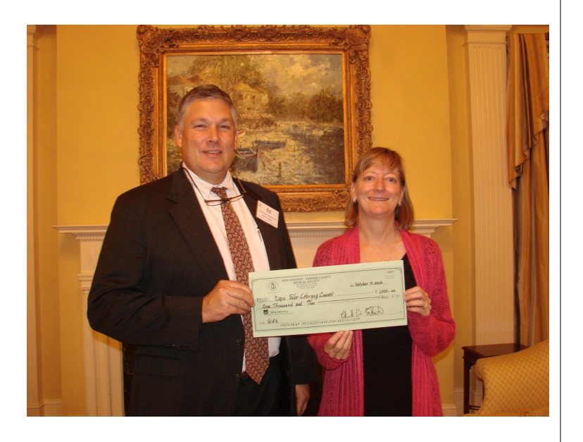
This year's Community Service Gift was presented to the Cape Fear Literacy Council on September 19, 2012.